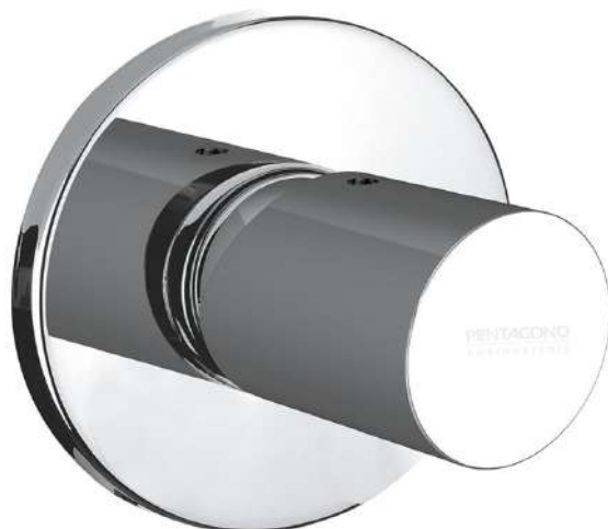
Cartridge mm 35